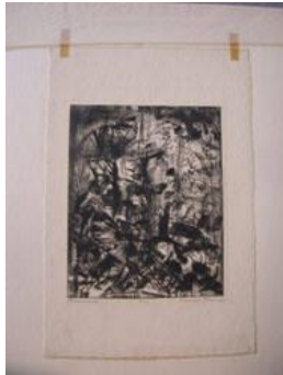
Title: Hurricane Date: 1936 Primary Maker: Howard Thomas Medium: Lithograph on paper