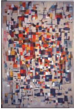
Title: Little Grand Canyon Yellow Date: 1964 Primary Maker: Howard Thomas Medium: Polyvinyl on canvas