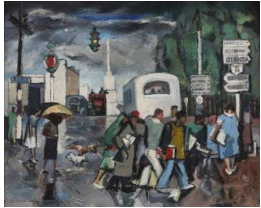
Title: Monuments and Mules Date: mid-20th Century Primary Maker: Howard Thomas Medium: Oil on canvas