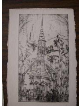
Title: Untitled (Church) Primary Maker: Howard Thomas Medium: Drypoint on paper