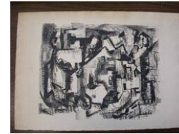
Title: Black Net Primary Maker: Howard Thomas Medium: Lithograph on paper