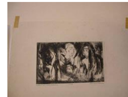
Title: White Virgin Of St. Scholastica Primary Maker: Howard Thomas Medium: Etching on paper