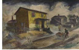
Title: Hound Dog House Date: mid-20th Century Primary Maker: Howard Thomas Medium: Oil on canvas