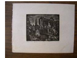
Title: Haymarket Square Date: 1936 Primary Maker: Howard Thomas Medium: Wood engraving on paper