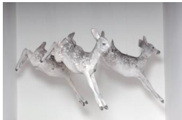
Title: Fawn (3 leaping fawns) Date: 2007 Primary Maker: Midori Harima Medium: Xerox copy on archival paper, methyl cellulose paste, archival tape, in three parts