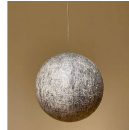
Title: The Owl Cluster in Cassiopeia Date: 2006 Primary Maker: Russell Crotty Medium: Ink and watercolor on paper on fiberglass sphere