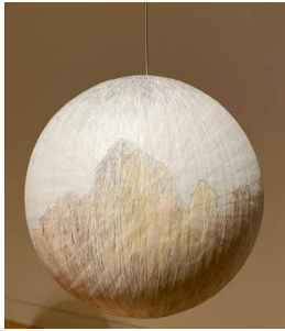
Title: Mars Over Sandstones Ridgeline Date: 2005 Primary Maker: Russell Crotty Medium: Ink and watercolor on paper on fiberglass sphere