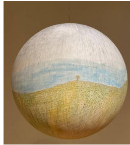
Title: Horse Property Date: 2005 Primary Maker: Russell Crotty Medium: Ink and watercolor on paper on fiberglass sphere