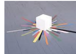
Title: There Date: 2002 Primary Maker: Tom Friedman Medium: Plastic and oil on enamel paint