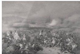
Title: Austerlitz, 20 November, 1805