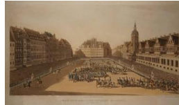
Title: Entry of the Allied Forces into Leipzig after the Victory of the Anti-Napoleonic Coalition in October 1813