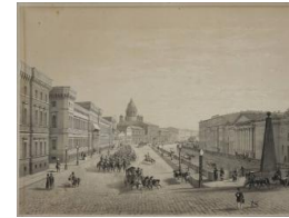
Title: View of Saint Petersburg, "Large Sea Street" with the building of the headquarters of the Chevalier Guard Regiment