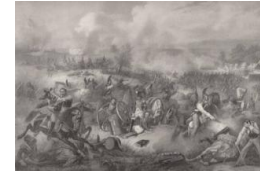
Title: Borodino, 26 August, 1812