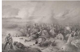
Title: Polotsk, 6 August, 1812