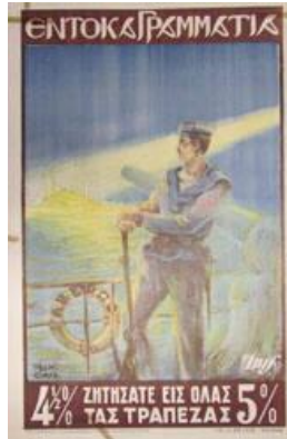
Title: Loan 4 1/2 - 5%