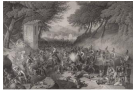
Title: Title – (no inscription) Four prints showing battles from the Napoleonic War of 1812-1814