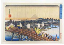
Title: Sunshower at Nihonbashi