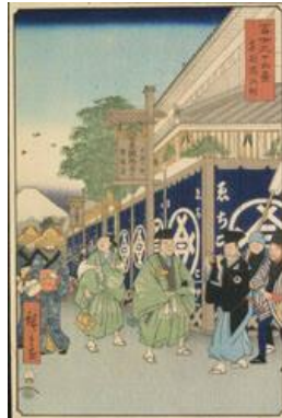
Title: Mt. Fuji from the Suruga District in the Eastern Capital, Plate 2 from the series Thirty-Six Views of Mt. Fuji