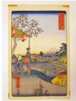
Title: The Teahouse with the View of Mt. Fuji from Zshigaya, from the series Thirty-six Views of Mt. Fuji