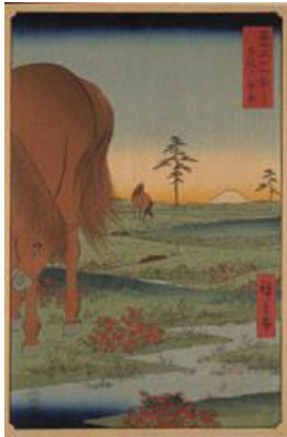
Title: Kogane Plain in Shimsa Province, from Thirty-six View of Mt. Fuji