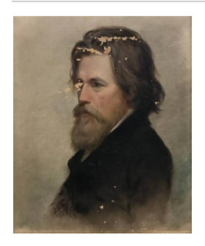
Title: Portrait of a man Primary Maker : Unidentified maker, Russian Medium : Oil on canvas