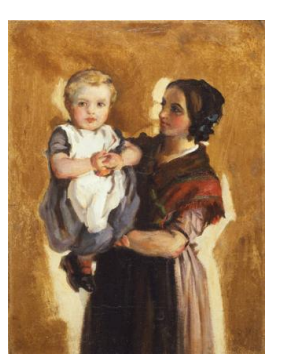
Title: Little Savoyard Child on the Arm of His Mother Date: 1869