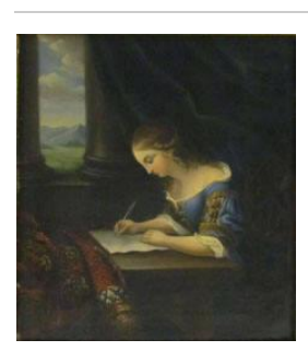
Title: Woman Writing Date: 18th Century Primary Maker: Unidentified