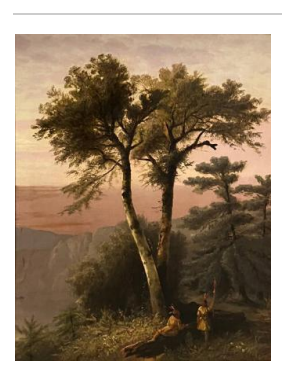
Title: Landscape with Indians Date: 1860 Primary Maker: Unidentified