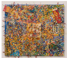
Title: #108 Memory Series: Sorry, It Was an Accident. Date: 1979 Primary Maker: Howardena Pindell Medium: Mixed media