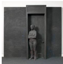
Title: Young Woman in Doorway Date: 1983 Primary Maker: George Segal Medium: Plaster, wood, paint, metal and Masonite