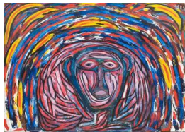
Title: Spirit of Grand Central Station -- The Man That Helped the Handicapped Date: 1990 Primary Maker: Thornton Dial Sr. Medium: Enamel on braided rope carpet and industrial sealing compound on canvas mounted on plywood