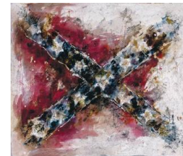
Title: Georgia II Date: 2008 Primary Maker: Leo Franklin Twiggs Medium: Batik on cotton mounted on board