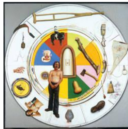
Title: Wheel of Life Date: 1992 Primary Maker: Gregory Gillespie Medium: Mixed media on panel