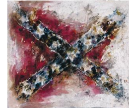
Title: Georgia II Date: 2008 Primary Maker: Leo Franklin Twiggs Medium: Batik on cotton mounted on board