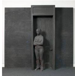
Title: Young Woman in Doorway Date: 1983 Primary Maker: George Segal Medium: Plaster, wood, paint, metal and Masonite