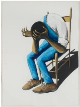
Title: Sinner Man Date: 1995 Primary Maker: Benny Andrews Medium: Oil, gouache and collage on paper