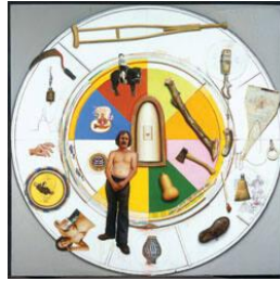
Title: Wheel of Life Date: 1992 Primary Maker: Gregory Gillespie Medium: Mixed media on panel