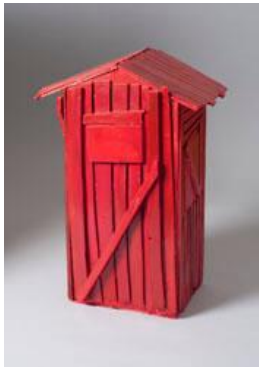
Title: Double Barn Backup Date: n.d. Primary Maker: Beverly Buchanan Medium: Painted foam board, glue, and nails