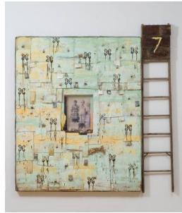
Title: 7 Steps Date: 1994 Primary Maker: Radcliffe Bailey Medium: Encaustic on burlap