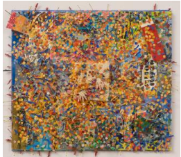
Title: #108 Memory Series: Sorry, It Was an Accident. Date: 1979 Primary Maker: Howardena Pindell Medium: Mixed media