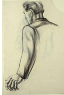
Title: Untitled - Partial Sketch of Head and Arm Primary Maker: Howard Cook Medium: Black conte crayon on wove paper