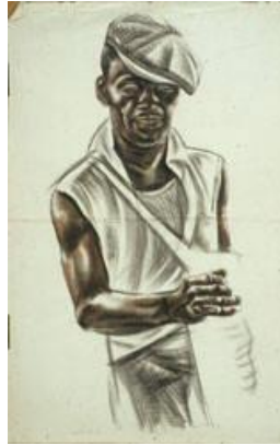
Title: Tuscaloosa Cotton Picker Date: 1935 Primary Maker: Howard Cook Medium: Conte crayon, charcoal and colored chalk on paper