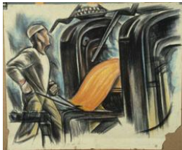
Title: Untitled Primary Maker: Howard Cook Medium: Conte crayon, charcoal and colored chalk on paper