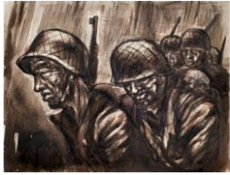
Title: Unknown - Weary Men, Rain - from Guadalcanal Grouping Date: 1943 Primary Maker: Howard Cook Medium: India and sepia inks, pen, and wash on wove paper mounted on backing board