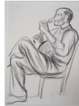
Title: Untitled - Altapass, NC - Man Playing Guitar Date: 1934 Primary Maker: Howard Cook Medium: Charcoal on wove paper