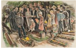
Title: Mountaineers Memorial Day - Altapass, NC Date: 1934 Primary Maker: Howard Cook Medium: Conte crayon, charcoal and colored chalk on paper