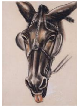
Title: Alabama Mule Primary Maker: Howard Cook Medium: Conte crayon, charcoal and colored chalk on paper