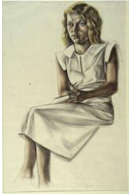
Title: Nance Biddix - Grassy Creek, NC Date: 1934 Primary Maker: Howard Cook Medium: Conte crayon, charcoal and colored chalk on wove paper