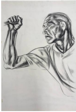
Title: Untitled (man with right arm bent), drawing for the mural The Importance of San Antonio in Texas History Date: 1937 Primary Maker: Howard Cook Medium: Black conte crayon on wove paper