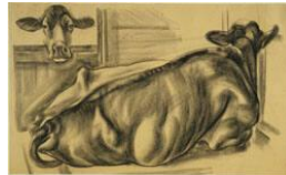
Title: Cow - Wing, North Carolina Date: 1934 Primary Maker: Howard Cook Medium: Conte crayon, charcoal and colored chalk on paper