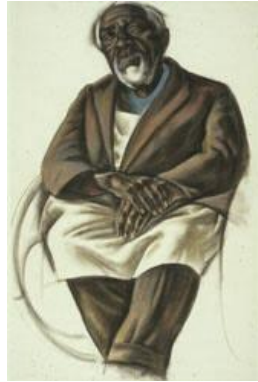
Title: Former Slave of Virginia Date: 1934 Primary Maker: Howard Cook Medium: Conte crayon, charcoal and colored chalk on paper