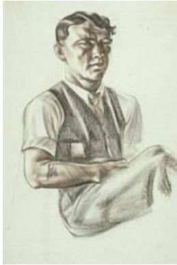
Title: Cumberland Mountain Sailor Date: 1934 Primary Maker: Howard Cook Medium: Conte crayon and charcoal on paper