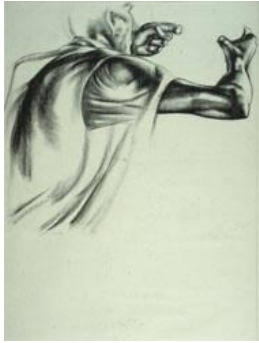
Title: Untitled (man with no gun) Date: 1937 Primary Maker: Howard Cook Medium: Black conte crayon on wove paper