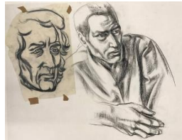
Title: Untitled (two heads and a hand), drawing for the mural The Importance of San Antonio in Texas History Date: 1937 Primary Maker: Howard Cook Medium: Black conte crayon on wove paper