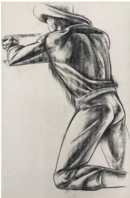
Title: Untitled (fringe coat), drawing for the mural The Importance of San Antonio in Texas History Date: 1937 Primary Maker: Howard Cook Medium: Black conte crayon on wove paper