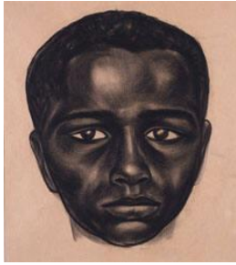
Title: Tuscaloosa Boy Date: 1935 Primary Maker: Howard Cook Medium: Charcoal on wove paper