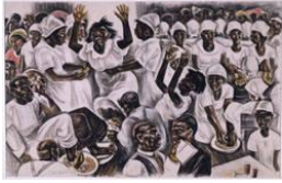
Title: Footwashing Baptist, Eutaw, Alabama Date: 1935 Primary Maker: Howard Cook Medium: Conte crayon, charcoal and colored chalk on paper