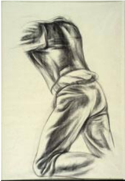
Title: Untitled - Torso Date: 1937 Primary Maker: Howard Cook Medium: Black conte crayon on wove paper