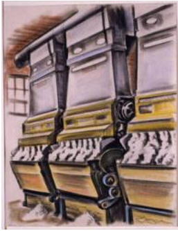
Title: Alabama Cotton Gin Date: 1935 Primary Maker: Howard Cook Medium: Charcoal and pastel on paper