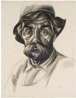
Title: Black Sol Day (Pine Mt., Kentucky) Date: 1934 Primary Maker: Howard Cook Medium: Black conte crayon and charcoal on wove on paper