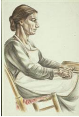
Title: Carding Wool - Penland, NC Date: 1934 Primary Maker: Howard Cook Medium: Conte crayon, charcoal and colored chalk on paper