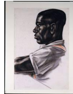
Title: Tuscaloosa Giant Date: 1925 Primary Maker: Howard Cook Medium: Conte crayon, charcoal and colored chalk on paper