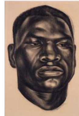
Title: The Indomitable One Date: 1951 Primary Maker: Howard Cook Medium: Charcoal on paper