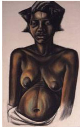
Title: Nude African - Virginia Date: 1934 Primary Maker: Howard Cook Medium: Conte crayon, charcoal and colored chalk on wove paper