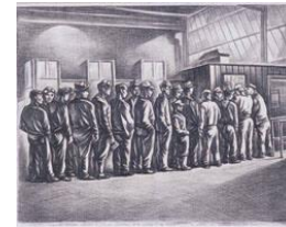
Title: Line Up of Navy Yard Workers Date: 1941 Primary Maker: Howard Cook Medium: Conte crayon on paper