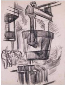
Title: Untitled-Alabama Steel Mill Date: 1935 Primary Maker: Howard Cook Medium: Charcoal and conte crayon on wove paper