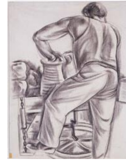
Title: Untitled - Potter Date: 1935 Primary Maker: Howard Cook Medium: Conte crayon, charcoal and colored chalk on paper