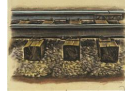
Title: Norfolk and Western Date: 1935 Primary Maker: Howard Cook Medium: Conte crayon, charcoal and colored chalk on paper