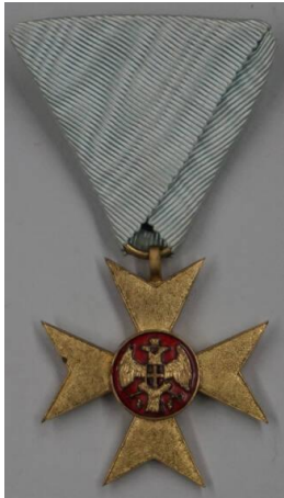
Title: Cross-shaped Medal (?) of the Kingdom of Yugoslavia on a Light Blue Silk Ribbon Date: Early 20th c Primary Maker: Unidentified maker, Russian Medium: Gilded brass, enamel, silk