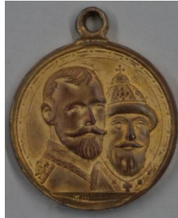
Title: Medal celebrating the 300th anniversary of the Romanov dynasty Date: 1913 Primary Maker: Unidentified maker, Russian Medium: Gilded bronze