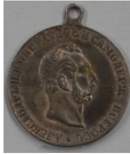
Title: Medal celebrating the 50th anniversary of the liberation of the Serves Date: 1911 Primary Maker: Unidentified maker, Russian Medium: Silver