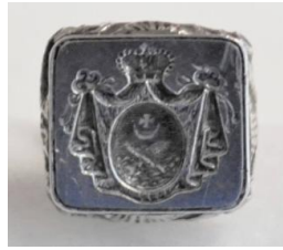
Title: Seal with the Belosselsky-Belozersky family crest Date: Second half of 19th century Primary Maker: Unidentified maker, Russian Medium: Silver