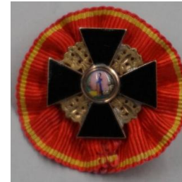
Title: Badge (Russian - "frachnyi znak") of the Order of Saint Anna (cross and a ribbon forming medallion) Date: Early 20th C Primary Maker: Unidentified maker, Russian Medium: Gold, enamel, silk