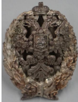
Title: Russian Imperial Badge Date: Late 19th to early 20th c Primary Maker: Unidentified maker, Russian Medium: Silver