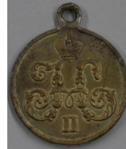
Title: Medal celebrating the Eight-Nation Alliance recapturing Tianjin, China (The Boxer Rebellion) Date: 1901 Primary Maker: Unidentified maker, Russian Medium: Silver