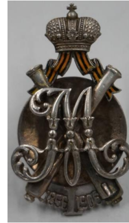
Title: Russian Imperial Badge