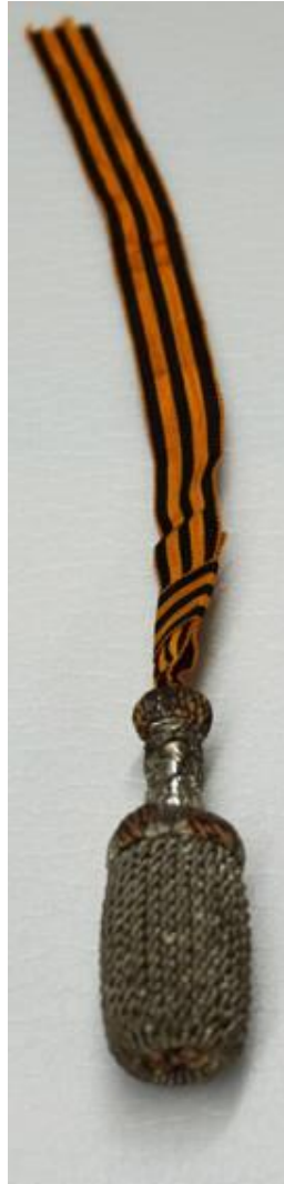
Title: Sword cord with the colors of the Order of Saint George Date: Early 20th century Primary Maker: Unidentified maker, Russian Medium: Silk