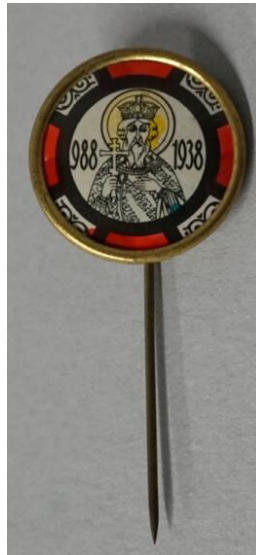
Title: Czechoslovakian pin Date: 1938 Primary Maker: Unidentified maker, Russian Medium: Gold, enamel