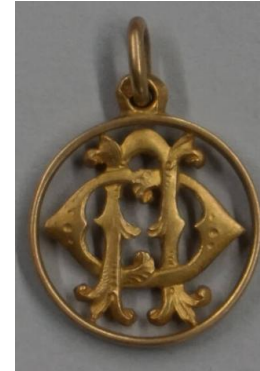
Title: Jetton Date: late 19th or early 20th century Primary Maker: Unidentified maker, Russian Medium: 14k gold