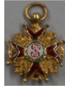
Title: Miniature cross of the Order of Saint Stanislav Cartier (?) Date: Early 20th C Primary Maker: Unidentified maker, Russian Medium: Gold, enamel