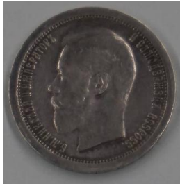
Title: Nicholas Silver Coin Date: 1895 Primary Maker: Unidentified maker, Russian Medium: Silver