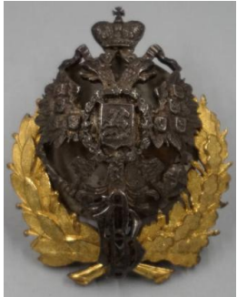
Title: Russian Imperial Badge Date: Late 19th to early 20th c. Primary Maker: Unidentified maker, Russian Medium: Silver, gold