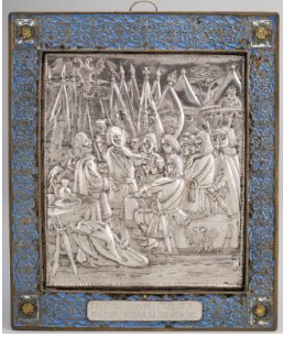
Title: Relief showing Peter the Great's feast on the battlefield at Poltava Date: 1809 Primary Maker: Unidentified maker, Russian Medium: Silver cast and chased, brass frame with blue and white enamel