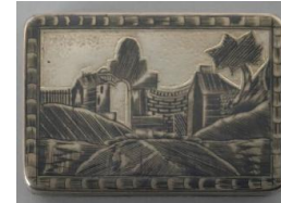
Title: Snuff box Date: 1838 Primary Maker: Unidentified maker, Russian Medium: Silver, silver gilt, and niello