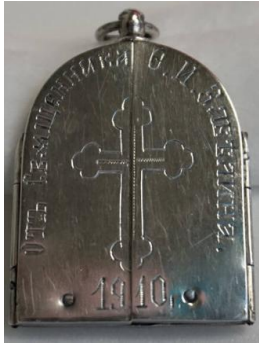
Title: Pendant triptych with a miniature icon of the Transfiguration of Christ