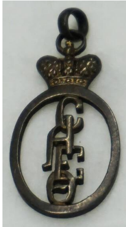
Title: Jetton Date: c. 1894 Primary Maker: Unidentified maker, Russian Medium: Silver, gilt remnants