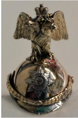
Title: Golden charm /locket in the form of a full-dress helmet of the Chevalier Guards with photo of Prince Sergei Sergeevich Belosselsky-Belozersky Date: 1914 Primary Maker: Unidentified maker, Russian Medium: 14K gold, silver, gilded silver, enamel, and photographic print on paper