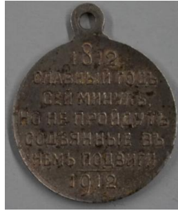
Title: Medal celebrating the centennial of the war of 1812