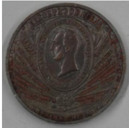
Title: Medal issued on the occasion of the liberation of the serves Date: 1861 Primary Maker: Unidentified maker, Russian Medium: Copper with silver plate