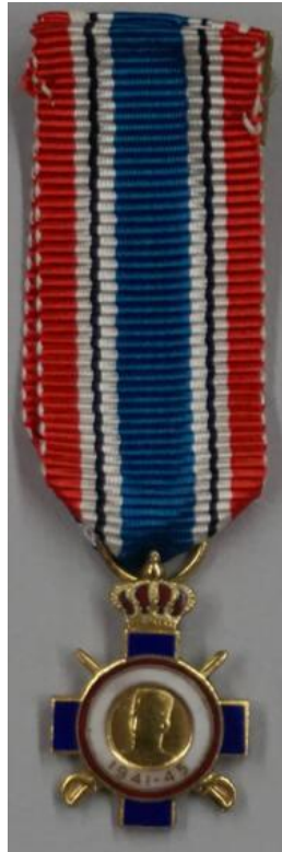
Title: Three miniature insignia of non-Russian orders suspended on ribbons with their respective colors Date: Early 20 c. Primary Maker: Unidentified maker, Russian Medium: Gold, enamel, silk