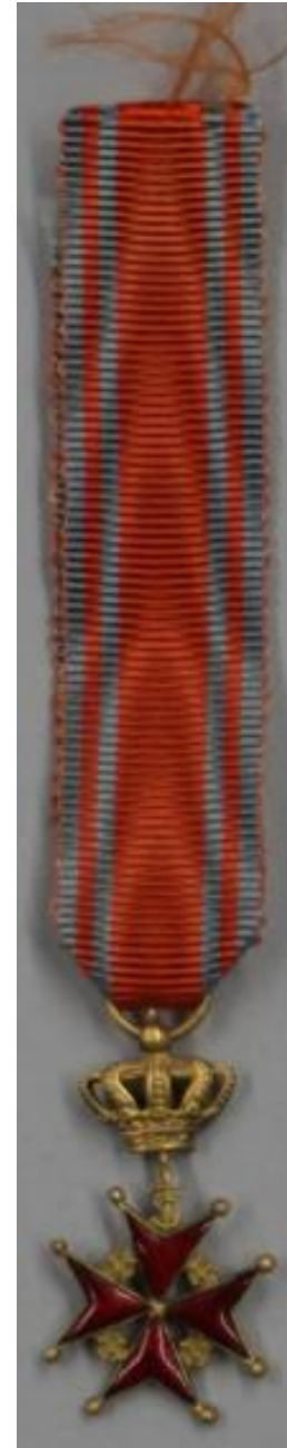
Title: Three miniature insignia of non-Russian orders suspended on ribbons with their respective colors Date: Early 20th c Primary Maker: Unidentified maker, Russian Medium: Gold, enamel, silk