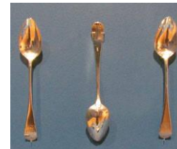
Title: Teaspoon Date: c. 1770 Primary Maker: Paul Revere Medium: Coin silver