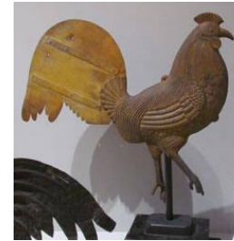
Title: Cock weathervane Date: c. 1880-1920 Primary Maker: Unidentified maker Medium: Copper