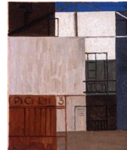
Title: Street PICIRII 3 Date: 1929 Primary Maker: Pierre Daura Medium: Oil