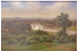
Title: Untitled (lake scene) Date: n.d. Primary Maker: Arthur Wardle Medium: Oil on canvas