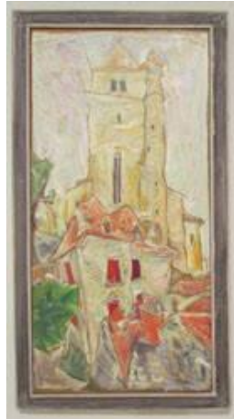
Title: St. Cirq, Church Elevation no. 1 Date: 1956 Primary Maker: Pierre Daura Medium: Oil on canvas