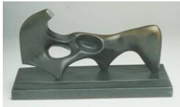
Title: Reclining Figure Date: 1973 CE Primary Maker: Henry Spencer Moore Medium: Bronze