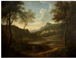
Title: Classical Landscape Date: 1739 Primary Maker: George Lambert Medium: Oil on canvas