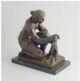
Title: La petite laveuse accroupie Date: conceived 1916, cast 1973 Primary Maker: Pierre Auguste Renoir Medium: Bronze