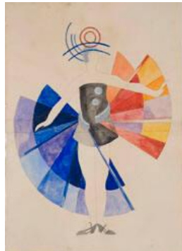
Title: Costume design for Aelita Date: 1924 Primary Maker: Alexandra Exter Medium: Graphite, collage and gouache on paper