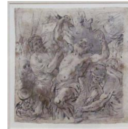
Title: Martyrdom of St. Bartholomew Primary Maker: 17th-century Neapolitan follower of Mattia Preti Medium: Brush and ink over chalk on paper