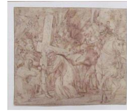
Title: The Way to Calvary Date: c. 1517 Primary Maker: Domenico Campagnola Medium: Pen and ink with wash on paper