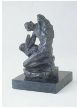
Title: L'Ecorche Date: 1903 Primary Maker: Henri Matisse Medium: Bronze