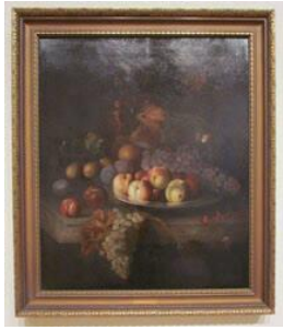
Title: Peaches, Grapes, Seven Plums on a Pewter Plate with a Melon, Pears, Apples, and Red Currants on a Marble Ledge Date: n.d. Primary Maker: Jakob Bogdani Medium: Oil on canvas