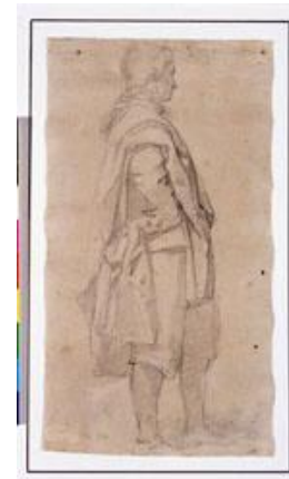
Title: Figure of a nobleman Date: ca. 1598 Primary Maker: Jacopo Chimenti da Empoli Medium: Black chalk on off-white paper