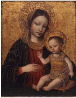
Title: Madonna and Child Date: 1490s Primary Maker: Ambrogio Borgognone Medium: Tempera on wood panel