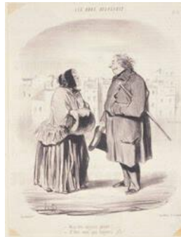
Title: Vous êtes toujours galant! Date: 1847 Primary Maker: Honore Daumier Medium: Lithograph on paper