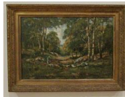
Title: Boisière à l'orée du bois (Woods at the Edge of the Forest) Date: n.d. Primary Maker: Camille Magnus Medium: Oil on canvas