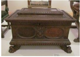
Title: Coffe Date: 16th century Primary Maker: Unidentified artist Medium: Wood (walnut)