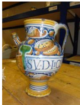
Title: Syrup jug, probably from Castel Durante, Italy Date: ca. 1560-1580 Primary Maker: Unidentified artist Medium: Maiolica ware (earthenware with tin oxide glaze)