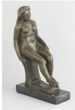
Title: Jeune fille assise Date: n.d. Primary Maker: Aristide Maillol Medium: Bronze