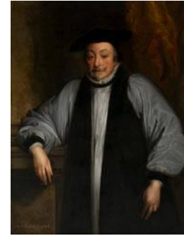
Title: Portrait of Archbishop William Laud Date: c. 1637-1638 Primary Maker: Studio of Anthony van Dyck Medium: Oil on canvas