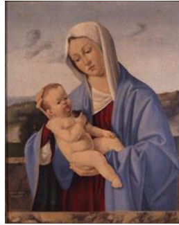
Title: Madonna and Child Date: ca. 1510–12 Primary Maker: Marco Basaiti Medium: Tempera on wood panel