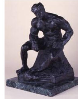
Title: L'Athlete (L'Athlete Americain) Date: 1901-1904 Primary Maker: Auguste Rodin Medium: Bronze with brown patina