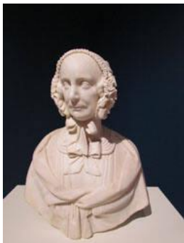
Title: Bust of a woman Date: n.d. Primary Maker: Patric Park Medium: Marble