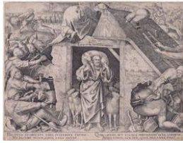
Title: The Parable of The Good Shepherd Date: 1565 Primary Maker: Philip Galle Medium: engraving