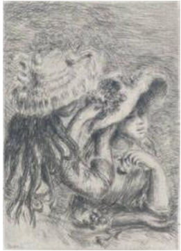
Title: Le Chapeau épinglé Date: 1894 Primary Maker: Pierre Auguste Renoir Medium: Etching on paper