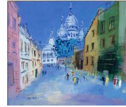
Title: Sacre Coeur Date: n.d. Primary Maker: Jean Dufy Medium: Oil on canvas