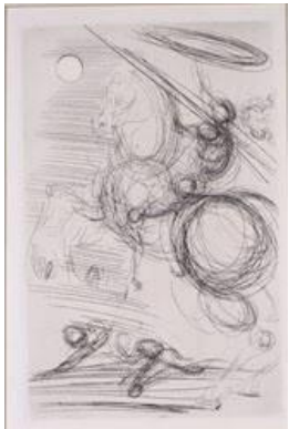
Title: Don Quixote Date: n.d. Primary Maker: Salvador Dalí Medium: Etching and dry point on wove paper