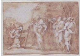
Title: Christ and the Centurion Primary Maker: Camillo Boccaccino Medium: Brush and wash with white heightening over chalk on paper