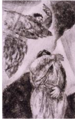
Title: Illustration from The Bible Series Date: n.d. Primary Maker: Marc Chagall Medium: Etching with fowl bite on paper