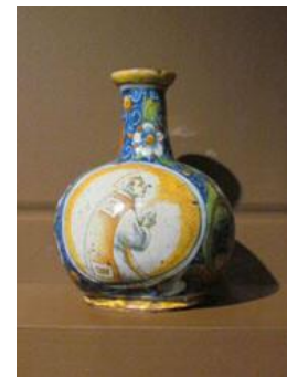
Title: Medicine bottle, probably from Venice Date: ca. 1560-1580 Primary Maker: Unidentified artist Medium: Maiolica ware (earthenware with tin oxide glaze)