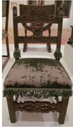
Title: Pillar back side chair Date: 16th century Primary Maker: Unidentified artist Medium: Wood (walnut)