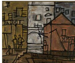
Title: San Rafael Date: 1928 Primary Maker: Joaquín Torres-García Medium: Oil on panel