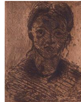
Title: Portrait of Young Girl Date: n.d. Primary Maker: Paul Cezanne Medium: Etching, mezzotint, rocker and fowl biting on laid paper