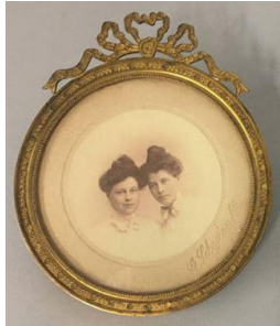
Title: Portrait of two young ladies (most likely descendants of R. T. Crane)

Medium: Photographic reproduction mounted on board