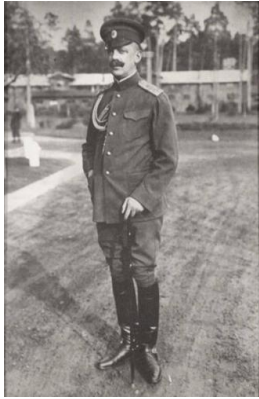
Title: Portrait of Prince Sergei Konstantinovich from ca. 1910