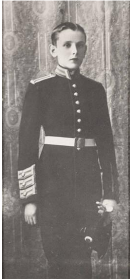
Title: Portrait of Prince Sergei Sergeevich from ca. 1910

Medium: Photographic print, silver, enamel, brass, wood