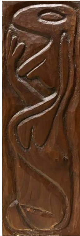
Title: Thinking Woman