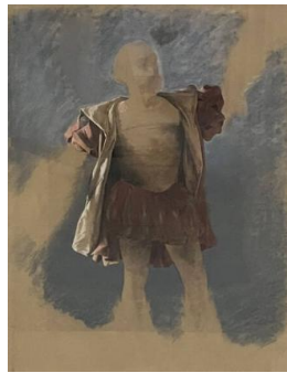
Title: Columbus-Clothed Torso Primary Maker: John Vanderlyn Medium: Colored chalks on paper