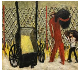
Title: The Cart (Ragpickers)