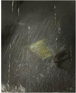
Title: Waterfall, #32 Date: 1988 Primary Maker: Pat Steir Medium: Spitbite, aquatint, hardground, softground, and drypoint on paper