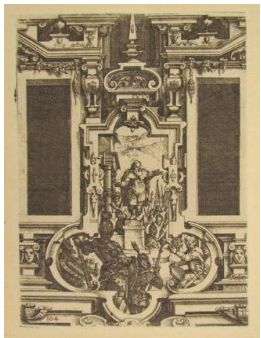
Title: Spanish Explorer /Conquistador, a book page: Architectural Design Illustration: Wall or Ceiling Design Date: 17th century Primary Maker: Unidentified maker, Russian Medium: Engraving on paper, restrike