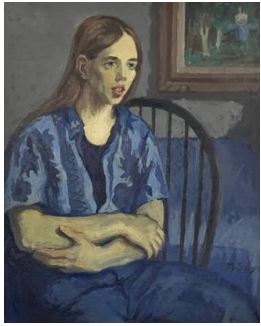
Title: Blake In Blue Jeans Date: 1970 Primary Maker: Moses Soyer Medium: Oil on fabric