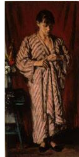
Title: Untitled (Woman In A Robe) Primary Maker: Louis Ritman Medium: Oil on canvas