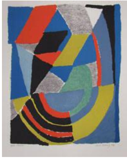
Title: Rythme couleur Date: 1973 Primary Maker: Sonia Delaunay Medium: Color lithograph on paper