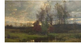
Title: The Pond