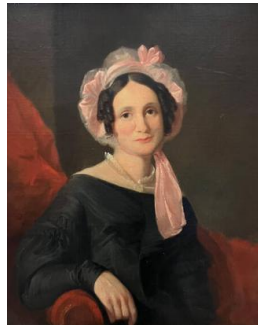
Title: Portrait Of A Lady Date: 1838 Primary Maker: John F. Francis Medium: Oil on canvas