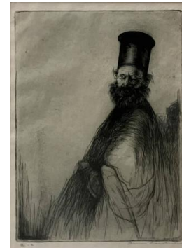
Title: Out Of Russia