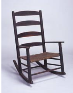
Title: Rocking chair Date: ca. 1830-1860 Primary Maker: Unidentified African-American in Georgia Medium: Hickory, yellow pine, split oak, and probably ash and soft maple