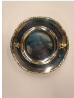
Title: Plate with emblem for the Astor family Date: c. 1890 Primary Maker: S. Kirk & Son Co., Baltimore, Maryland Medium: Sterling silver and gold or silver gilt