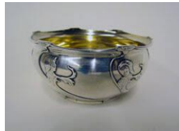
Title: Porringer Date: c. 1890 Primary Maker: Gorham Manufacturing Company Medium: Sterling silver