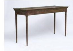
Title: Slab table Date: ca 1790-1830 Primary Maker: Unidentified maker Medium: Yellow pine