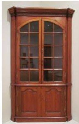
Title: Corner cupboard Date: c. 1790 - 1830 Primary Maker: Unidentified maker Medium: Yellow pine