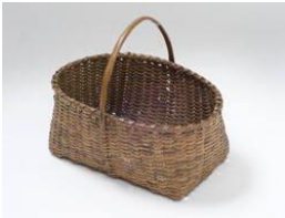
Title: Basket Date: c. 1850-1900 Primary Maker: Unidentified maker Medium: Oak splints and river cane