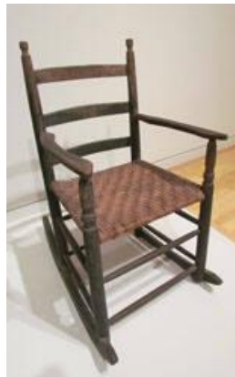
Title: Arm chair with rockers Date: ca. 1780-1830 Primary Maker: Unidentified maker, Virginia or Georgia Medium: Unidentified hardwoods