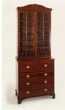
Title: Secretary and bookcase Date: c. 1800-1820 Primary Maker: Unidentified maker, Lower Southern Piedmont, possibly Augusta, Georgia Medium: Birch, walnut, yellow pine, holly, brass, and ivory or bone