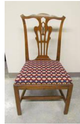
Title: Chair Date: ca. 1770-1800 Primary Maker: Unidentified maker Medium: Cherry and beech