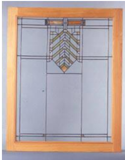
Title: Window from Walser House, 42 N. Central Ave., Chicago, Illinois Date: 1903 Primary Maker: Frank Lloyd Wright Medium: Stained glass