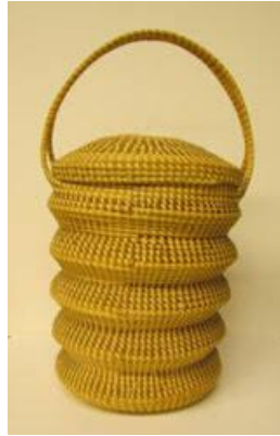
Title: Sewing basket Date: c. 1980-2000 Primary Maker: Unidentified maker Medium: Sweetgrass