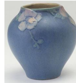
Title: Vase Date: 1924 Primary Maker: Newcomb College Pottery Medium: Glazed ceramic