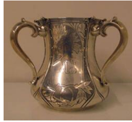
Title: Trig Date: c. 1890 Primary Maker: Tiffany & Co. Medium: Sterling silver