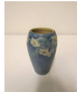
Title: Vase Date: n.d. Primary Maker: Newcomb College Pottery Medium: Glazed ceramic