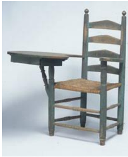
Title: Writing chair Date: 1840 CE Primary Maker: Unidentified maker Medium: Yellow pine, birch, and ash