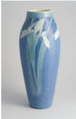
Title: Vase Date: 1924 Primary Maker: Newcomb College Pottery Medium: Glazed earthenware