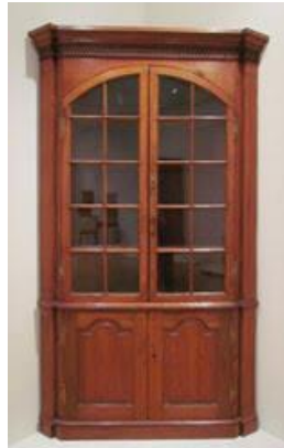
Title: Corner cupboard Date: c. 1790 - 1830 Primary Maker: Unidentified maker Medium: Yellow pine