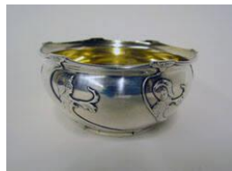
Title: Porringer Date: c. 1890 Primary Maker: Gorham Manufacturing Company Medium: Sterling silver