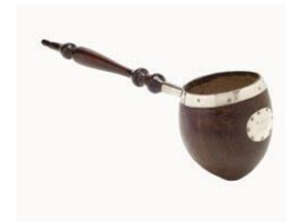
Title: Water dipper from Ivanhoe Plantation, Burke County, Georgia Date: c. 1820-1850 Primary Maker: Unidentified maker Medium: Coconut shell, unidentified wood and silver