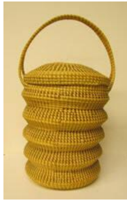
Title: Sewing basket Date: c. 1980-2000 Primary Maker: Unidentified maker Medium: Sweetgrass