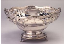
Title: Basket Date: ca. 1850-1856 Primary Maker: Horton & Rikeman Medium: Coin silver