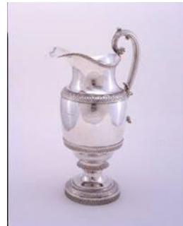
Title: Pitcher Date: c. 1836 Primary Maker: Baldwin Gardiner Medium: Silver