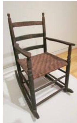
Title: Arm chair with rockers Date: ca. 1780-1830 Primary Maker: Unidentified maker, Virginia or Georgia Medium: Unidentified hardwoods