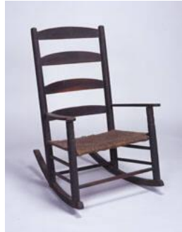
Title: Rocking chair Date: ca. 1830-1860 Primary Maker: Unidentified African-American in Georgia Medium: Hickory, yellow pine, split oak, and probably ash and soft maple