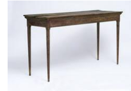
Title: Slab table Date: ca 1790-1830 Primary Maker: Unidentified maker Medium: Yellow pine