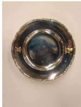
Title: Plate with emblem for the Astor family Date: c. 1890 Primary Maker: S. Kirk & Son Co., Baltimore, Maryland Medium: Sterling silver and gold or silver gilt