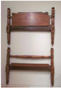
Title: Bed with slats Date: c. 1850 Primary Maker: Caleb Shaw Medium: River birch and yellow pine