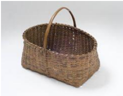
Title: Basket, Northeast Georgia or Western South Carolina Date: late 19th Century Primary Maker: Unidentified maker Medium: Oak splints and rivercane