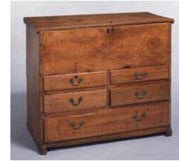
Title: Chest over drawers Date: c. 1740-1790 Medium: Primary woods: Red gum or sweet gum. Poplar sides. Secondary woods: oak drawer interiors and southern yellow pine back and interior framing