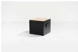
Title: Side table Date: c. 1930 Primary Maker: Huib Hoste Medium: Black-and-white lacquered wood