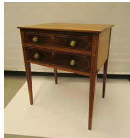
Title: Table or stand Date: partly c. 1800 and partly c. 1940 Primary Maker: Henry Eugene Thomas Medium: Walnut, maple, poplar, southern yellow pine, and mahogany crotch veneer