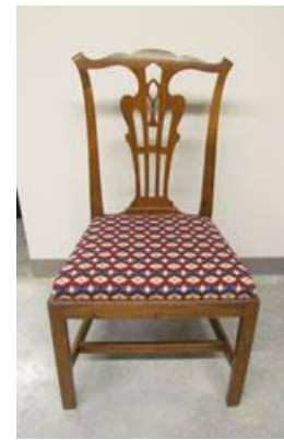
Title: Chair Date: ca. 1770-1800 Primary Maker: Unidentified maker Medium: Cherry and beech