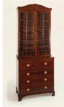
Title: Secretary and bookcase Date: c. 1800-1820 Primary Maker: Unidentified maker, Lower Southern Piedmont, possibly Augusta, Georgia Medium: Birch, walnut, yellow pine, holly, brass, and ivory or bone