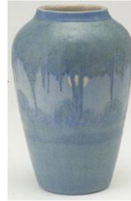
Title: Vase Date: 1919 Primary Maker: Newcomb College Pottery Medium: Glazed ceramic