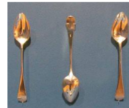
Title: Teaspoon Date: c. 1770 Primary Maker: Paul Revere Medium: Coin silver