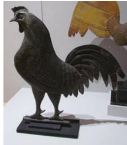
Title: Cock weathervane Date: c. 1880-1920 Primary Maker: Unidentified maker Medium: Cast iron