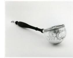
Title: Water dipper Date: c. 1853 Primary Maker: Unidentified maker Medium: Silver and unidentified wood, possibly a close-grained exotic wood