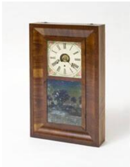
Title: Mantel clock Date: ca. 1850 Primary Maker: New Haven Clock Company Medium: Mixed woods, metals, and glass