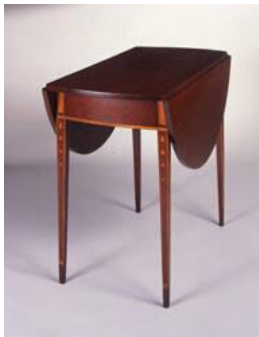
Title: Drop-leaf table, or Pembroke table Date: c. 1795-1815 Primary Maker: Unidentified maker, lower Southern piedmont Medium: Primary wood: cherry; secondary wood: southern yellow pine; inlay: lightwood, possibly sycamore