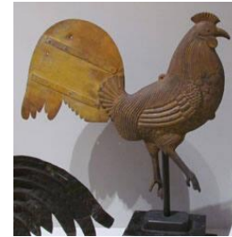
Title: Cock weathervane Date: c. 1880-1920 Primary Maker: Unidentified maker Medium: Copper