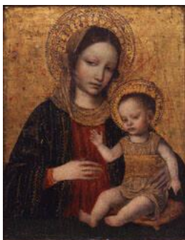
Title: Madonna and Child Date: 1490s Primary Maker: Ambrogio Borgognone Medium: Tempera on wood panel