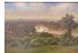
Title: Untitled (lake scene) Date: n.d. Primary Maker: Arthur Wardle Medium: Oil on canvas