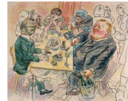
Title: The Blessings of Labor