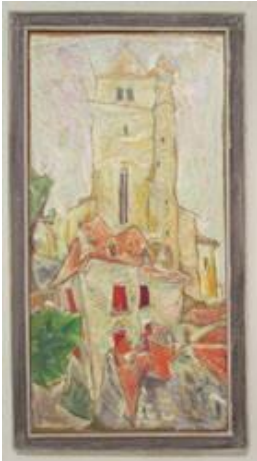
Title: St. Cirq, Church Elevation no. 1 Date: 1956 Primary Maker: Pierre Daura Medium: Oil on canvas