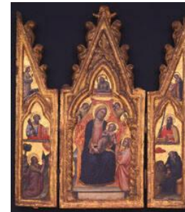
Title: Madonna and Child with Saints Date: 1370–80 Primary Maker: Simone dei Crocifissi Medium: Tempera on wood panels