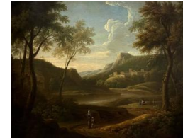
Title: Classical Landscape Date: 1739 Primary Maker: George Lambert Medium: Oil on canvas