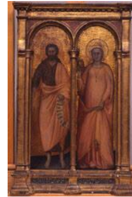
Title: Saint Catherine of Alexandria and Saint John the Baptist Date: 1363 Primary Maker: Giusto de' Menabuoi Medium: Tempera on wooden panel