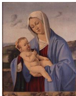
Title: Madonna and Child Date: ca. 1510–12 Primary Maker: Marco Basaiti Medium: Tempera on wood panel