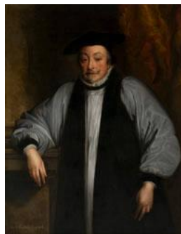
Title: Portrait of Archbishop William Laud Date: c. 1637-1638 Primary Maker: Studio of Anthony van Dyck Medium: Oil on canvas