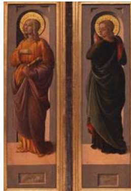
Title: Two Saints Date: 1460s Primary Maker: Fra Diamante Medium: Tempera on wood panels