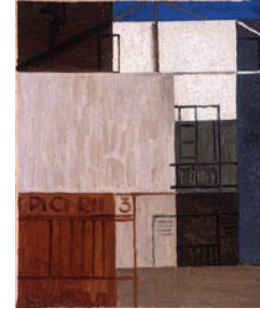
Title: Street PICIRII 3