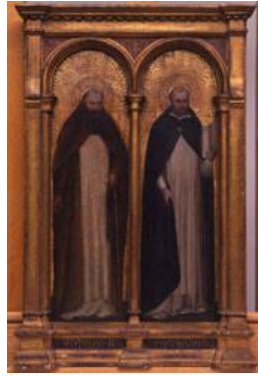
Title: St. Thomas Aquinas and St. Anthony Abbot Date: 1363 Primary Maker: Giusto de' Menabuoi Medium: Tempera on wood panel