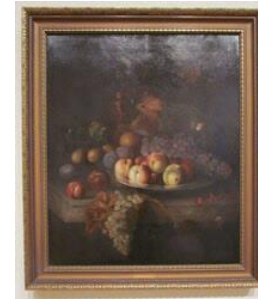
Title: Peaches, Grapes, Seven Plums on a Pewter Plate with a Melon, Pears, Apples, and Red Currants on a Marble Ledge Date: n.d. Primary Maker: Jakob Bogdani Medium: Oil on canvas