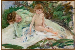
Title: Study for The Sun Bath