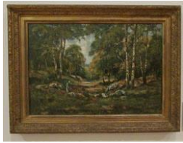
Title: Boisière à l'orée du bois (Woods at the Edge of the Forest)