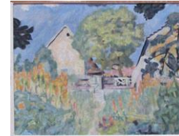
Title: Ma Maison à Vernon: Le Jardin (My House in Vernon: The Garden)