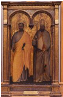
Title: St. Paul and St. Augustine Date: 1363 Primary Maker: Giusto de' Menabuoi Medium: Tempera on wooden panel