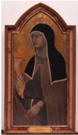
Title: St. Clare Date: 1335 Primary Maker: Master of the Loeser Madonna Medium: Tempera on wood panel