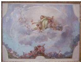
Title: Study for a Ceiling

Primary Maker: Giuseppe Bernardino Bison