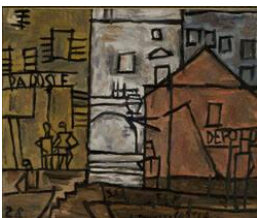
Title: San Rafael Date: 1928 Primary Maker: Joaquín Torres-García Medium: Oil on panel